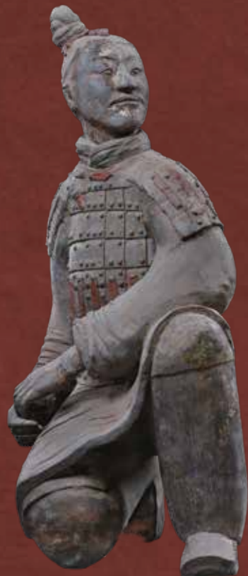
◀ 跪射俑 Terracotta kneeling archer

秦代 西安市秦始皇帝陵區一號兵馬俑坑出土 秦始皇帝陵博物院藏 Qin dynasty Unearthed from Pit No. 1 of the Terracotta Army, Mausoleum site of Emperor Qin Shihuang, Xi'an City Collection of Emperor Qinshihuang's Mausoleum Site Museum