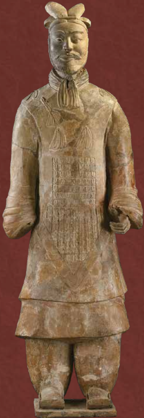
◀ 高級軍吏俑 Terracotta general

秦代 西安市秦始皇帝陵區一號兵馬俑坑出土 秦始皇帝陵博物院藏 Qin dynasty Unearthed from Pit No. 1 of the Terracotta Army, Mausoleum site of Emperor Qin Shihuang, Xi'an City Collection of Emperor Qinshihuang's Mausoleum Site Museum