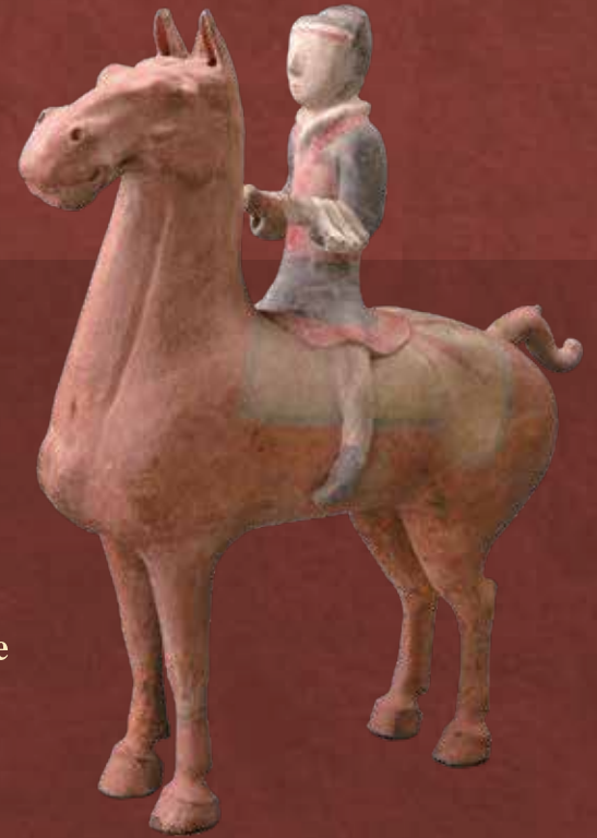
▶ 彩繪騎馬俑 Painted cavalry figurine

秦代 西安市秦始皇帝陵區二號兵馬俑坑出土 秦始皇帝陵博物院藏 Qin dynasty Unearthed from Pit No. 2 of the Terracotta Army, Mausoleum site of Emperor Qin Shihuang, Xi'an City Collection of Emperor Qinshihuang's Mausoleum Site Museum