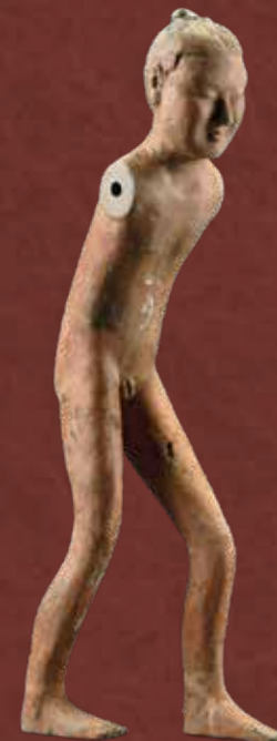
◀ 着衣式行走武士俑 Naked warrior figurine in walking pose

漢代 漢長陵陪葬墓出土 漢景帝陽陵博物院藏 Han dynasty Unearthed from the tombs of Han Changling Mausoleum Collection of Hanyangling Museum