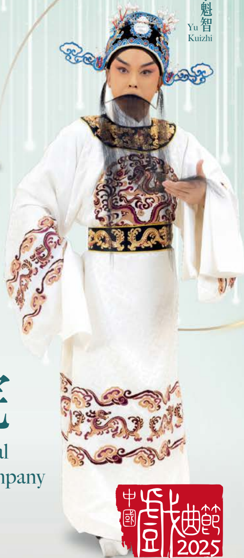
于魁智 Yu Kuizhi